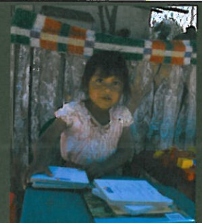
Heritage College Guatemala Project

You are invited to invest in our heritage , invest in educating our youth, invest in keeping our talent in the Outaouais and invest in grooming tomorrow's workforce and leaders.